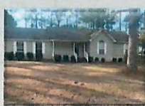
3 Bed / 2 Bath home Opp MLS # 23039 Alexander Avenue