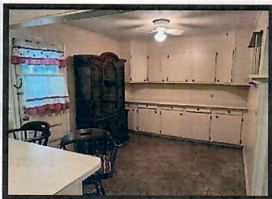
102 Fay Street Opp

* 3 Bedroom 1.5 Bath Home * Screened in back porch Call for a showing today