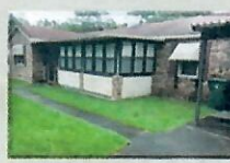
3 Bed / 1 Bath Home Opp MLS # 23060 Spurlin Street