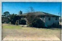
3 Bed / 2 Bath Home on 50 acres Opp MLS # 23015