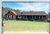
3 Bed / 3 Bath 7.4 Acres Opp MLS #23124 Glen Street