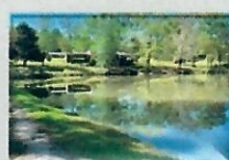
3 Bed / 2 Bath 50 Acres Andalusia MLS # 23170 Opine Road